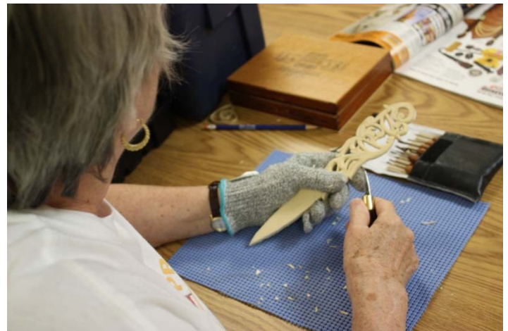
Woodcarving, Tuesdays, 9 am to Noon